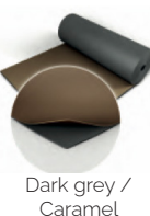
Dark grey / Caramel 056