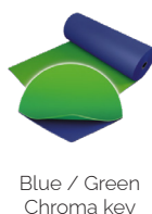
Blue / Green Chroma key 060