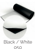
Black / White 050