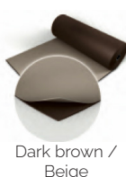
Dark brown / Beige 057