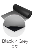
Black / Grey 051