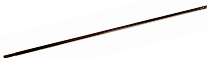
Black (available to order)